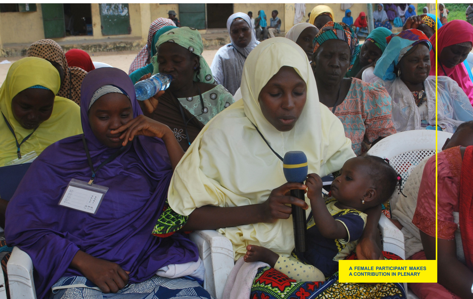
A FEMALE PARTICIPANT MAKES A CONTRIBUTION IN PLENARY

In the tables below, you will find a summary of our discussions: