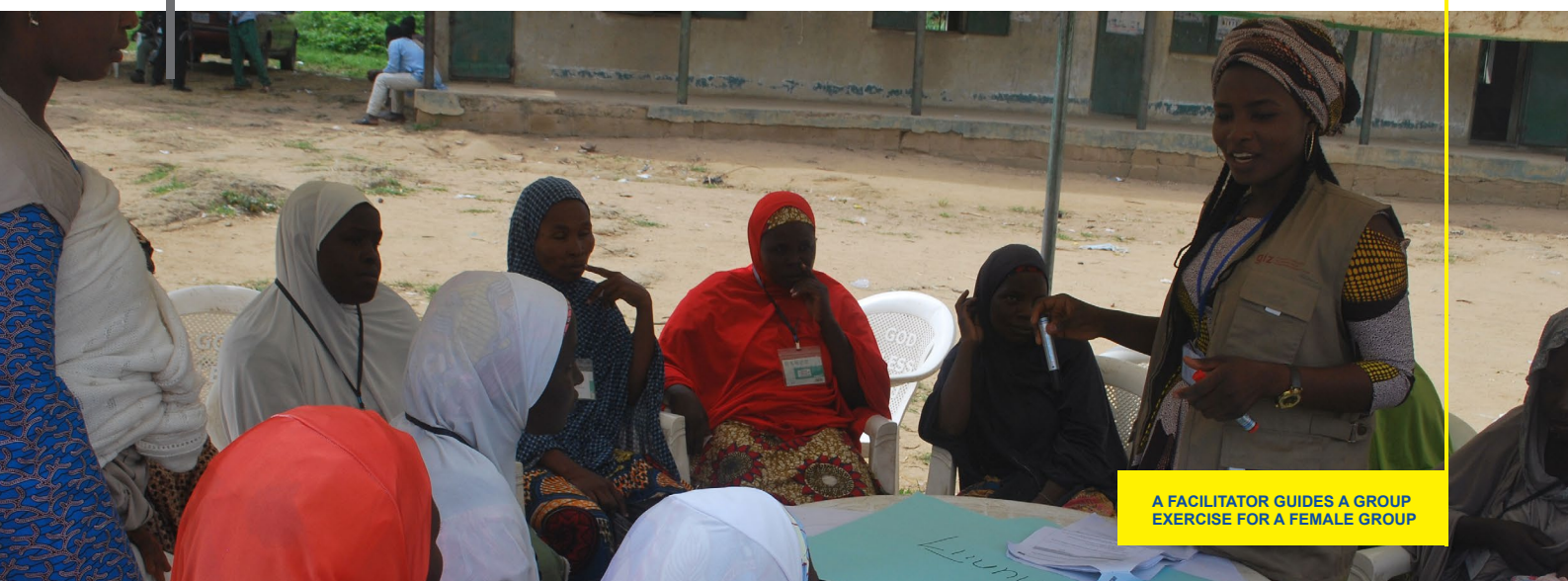
A FACILITATOR GUIDES A GROUP EXERCISE FOR A FEMALE GROUP