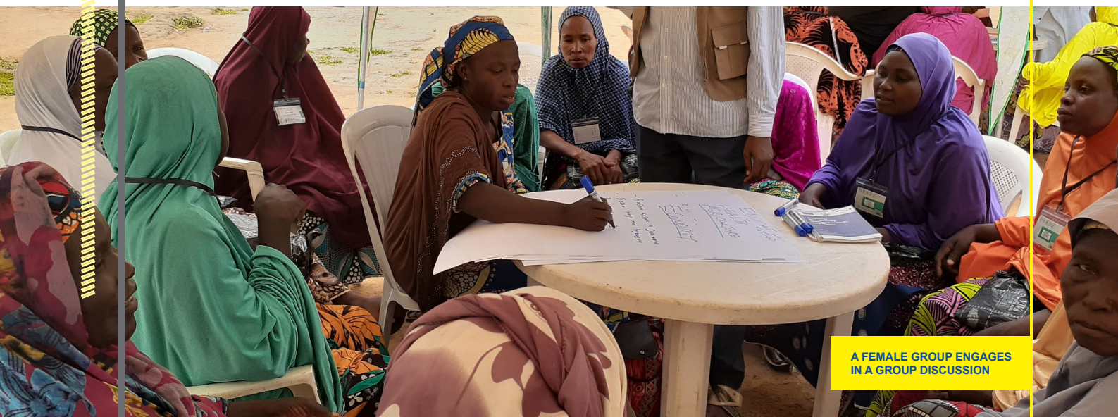
A FEMALE GROUP ENGAGES IN A GROUP DISCUSSION