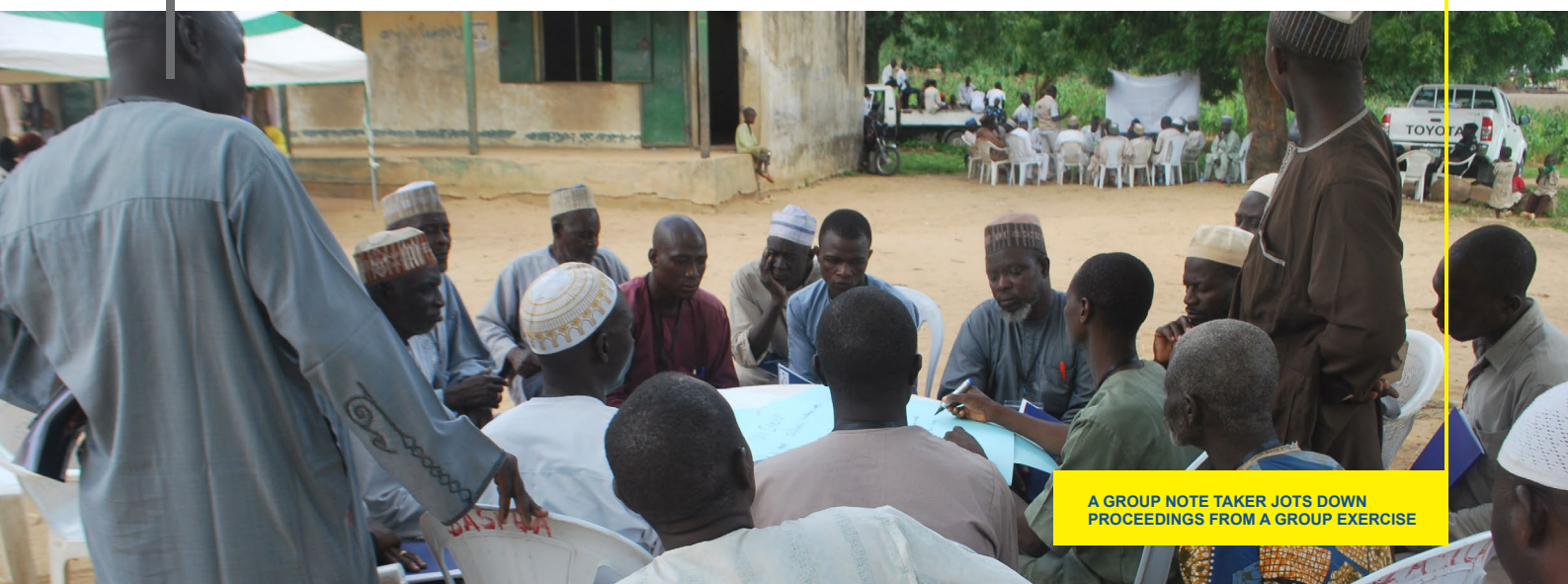
A GROUP NOTE TAKER JOTS DOWN PROCEEDINGS FROM A GROUP EXERCISE