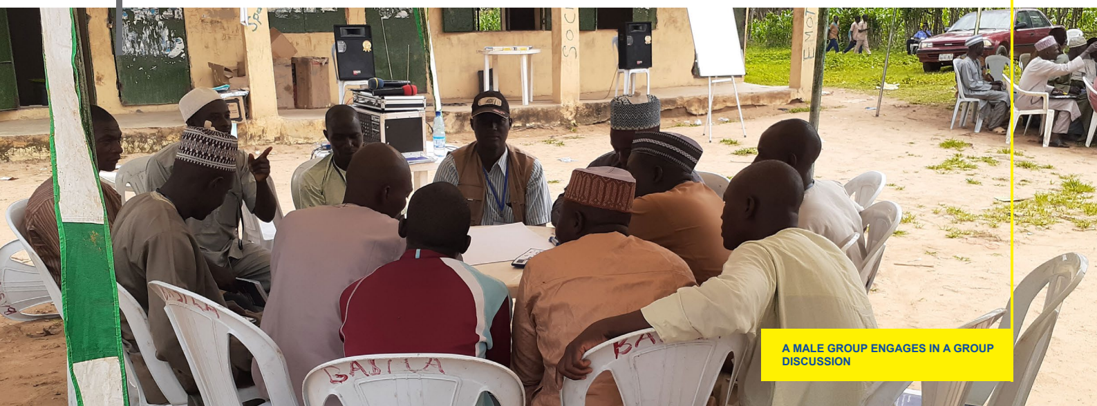
A MALE GROUP ENGAGES IN A GROUP DISCUSSION