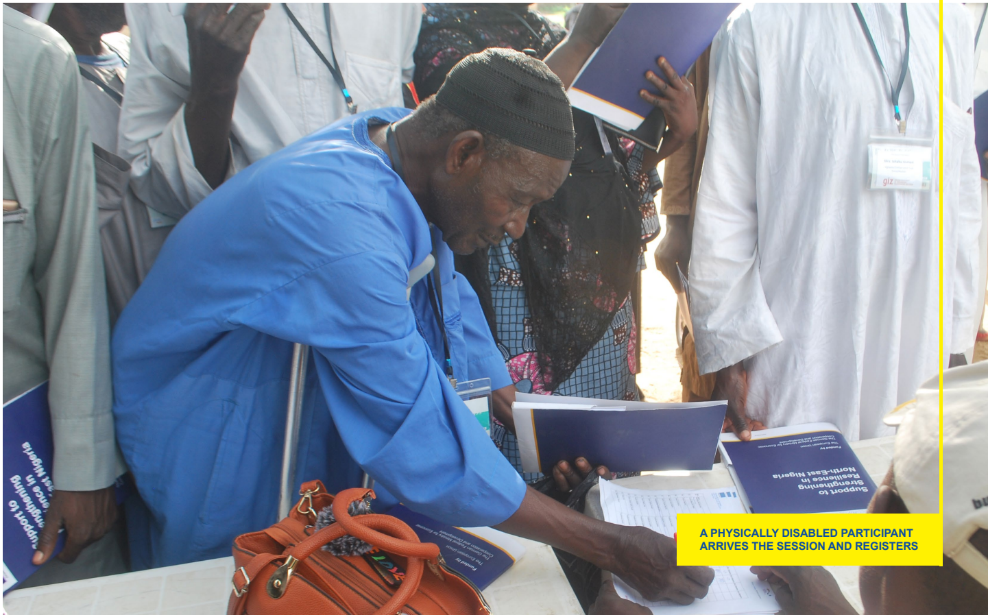
A PHYSICALLY DISABLED PARTICIPANT ARRIVES THE SESSION AND REGISTERS

farmlands, grazing lands, mountains/hills, rivers/streams, food and cash crops, health facilities, schools, religious worship centres, local gravels, stones, etc. Problems in the community that were identified are; Inadequate drugs and health equipment in the health facilities, inadequate and unqualified teachers, dilapidated schools and hospital buildings, inadequate modern farm machinery, high unemployment rate, etc. The community participants discussed their community problems and proffered workable solutions and activities to embark upon to solve the identified problems. At the end of the sessions, a follow-up committee was established and tasked with the responsibility of advocating and lobbying for projects on behalf of our communities.