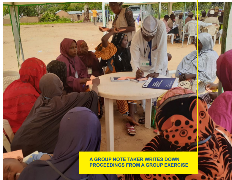
A GROUP NOTE TAKER WRITES DOWN PROCEEDINGS FROM A GROUP EXERCISE