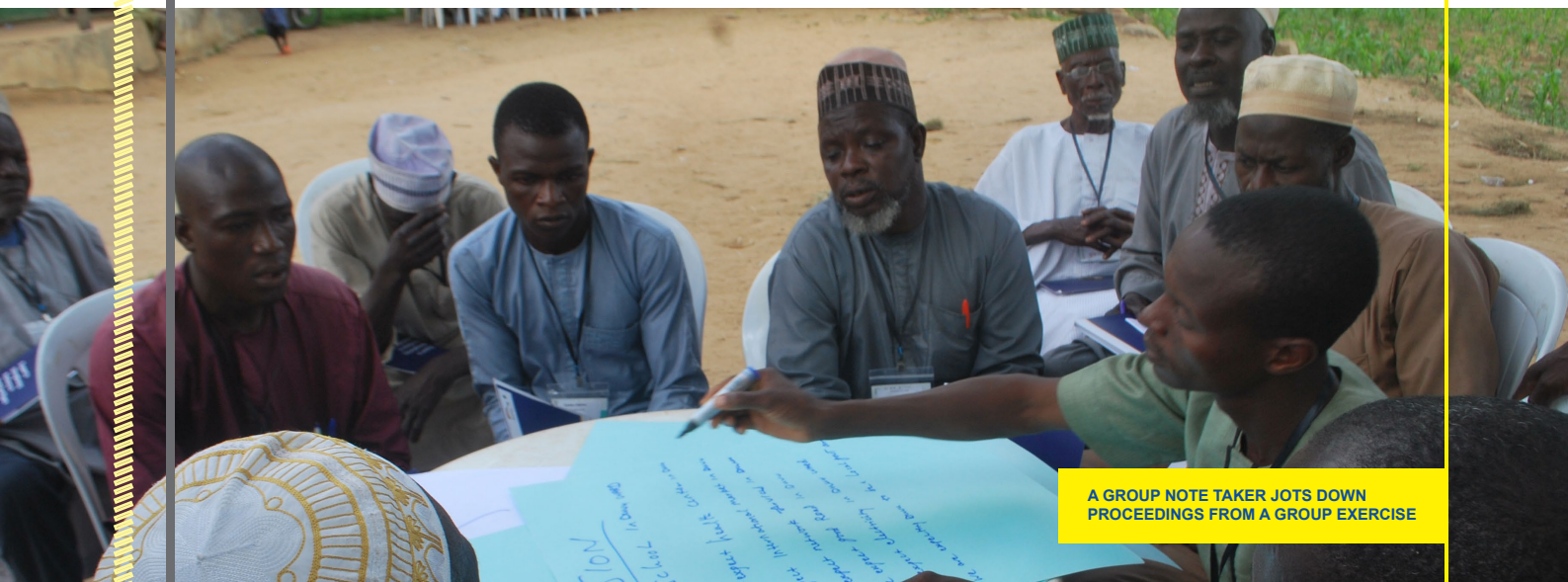
A GROUP NOTE TAKER JOTS DOWN PROCEEDINGS FROM A GROUP EXERCISE