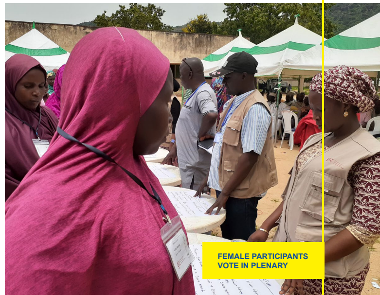
FEMALE PARTICIPANTS VOTE IN PLENARY