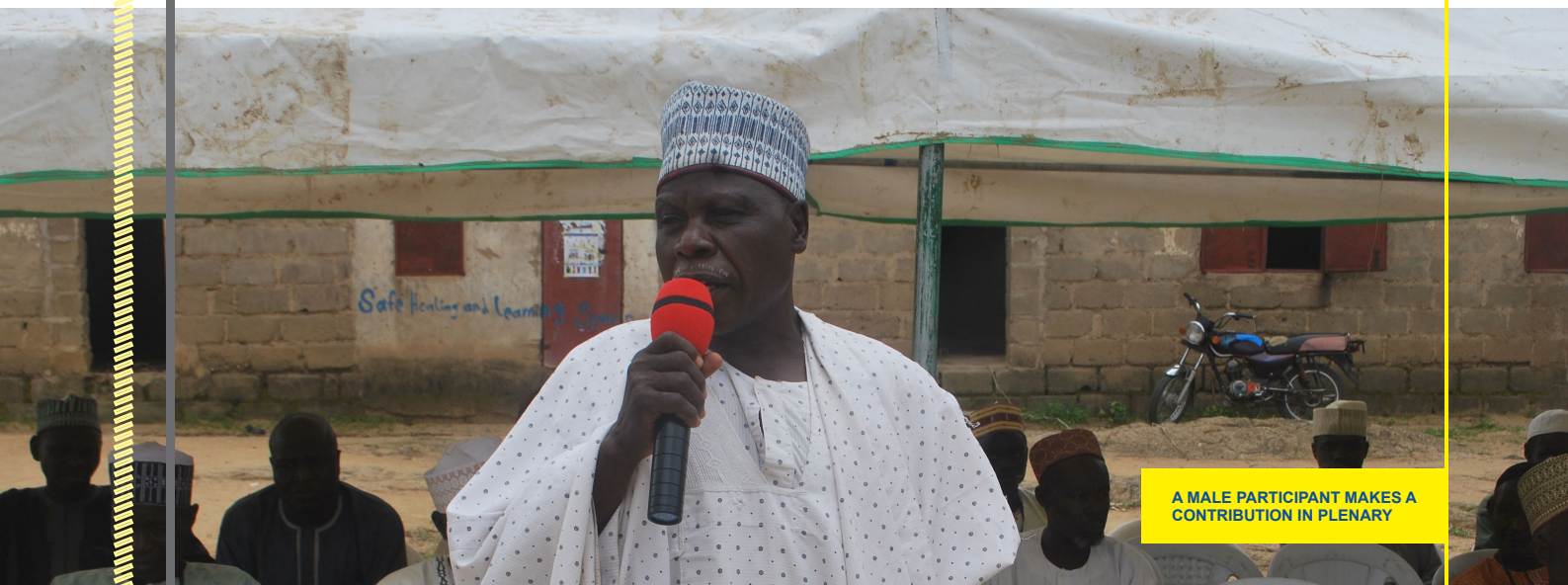
A MALE PARTICIPANT MAKES A CONTRIBUTION IN PLENARY