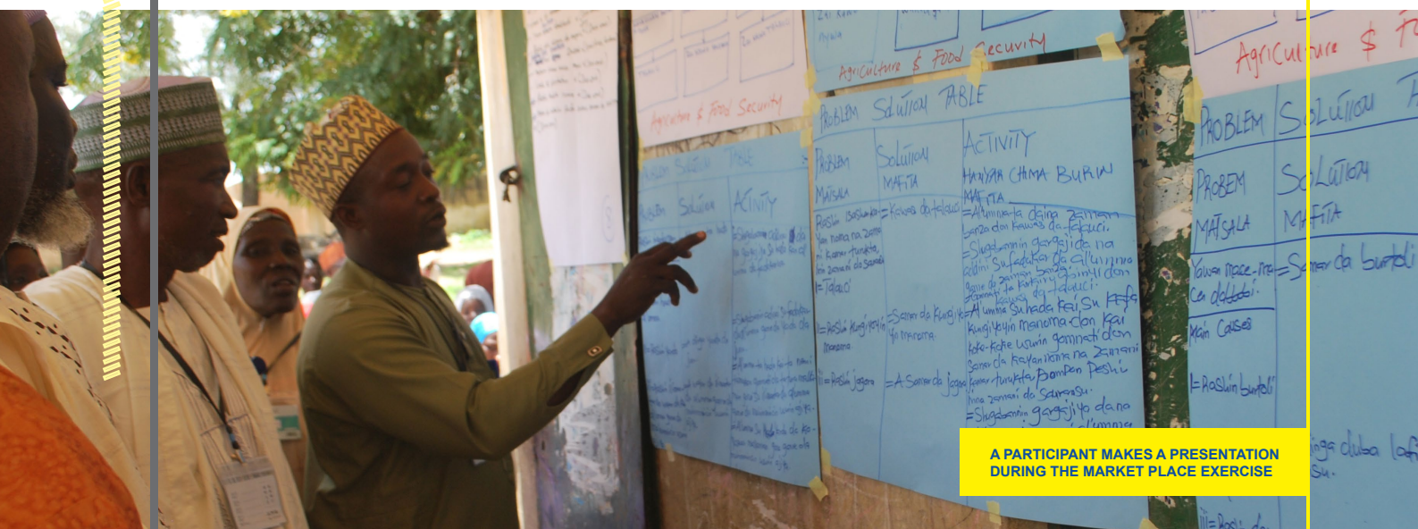
A PARTICIPANT MAKES A PRESENTATION DURING THE MARKET PLACE EXERCISE