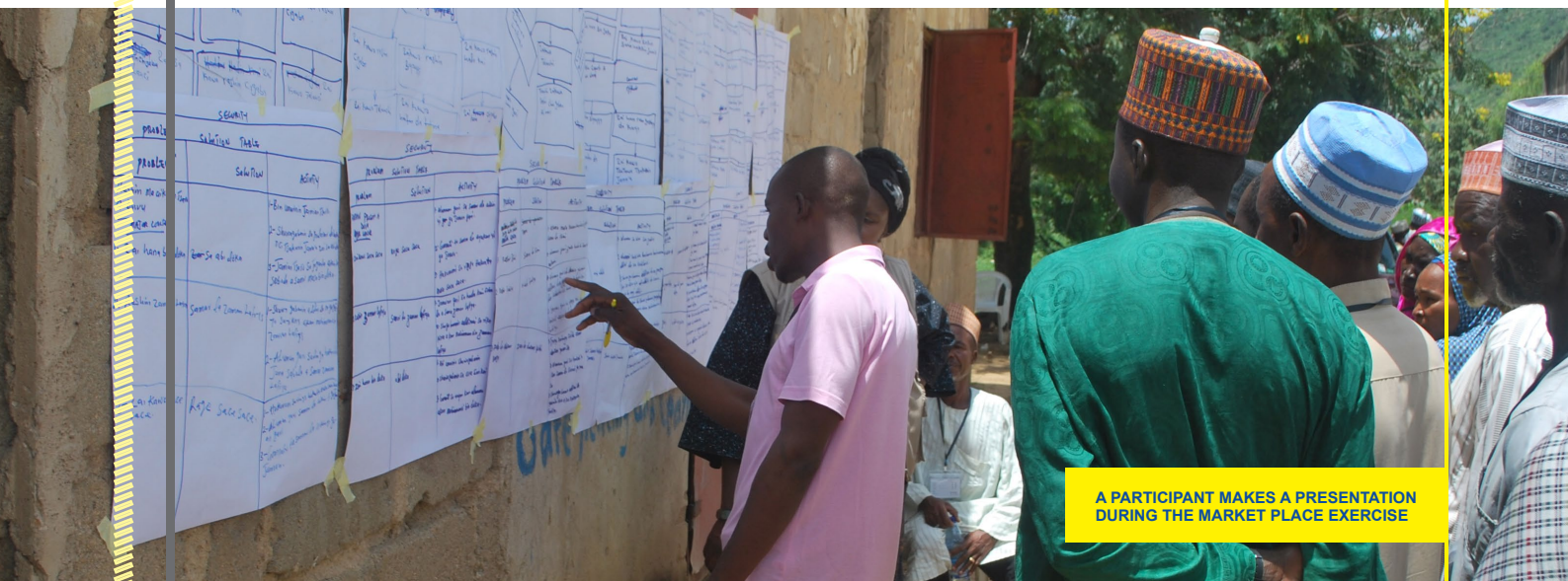
A PARTICIPANT MAKES A PRESENTATION DURING THE MARKET PLACE EXERCISE