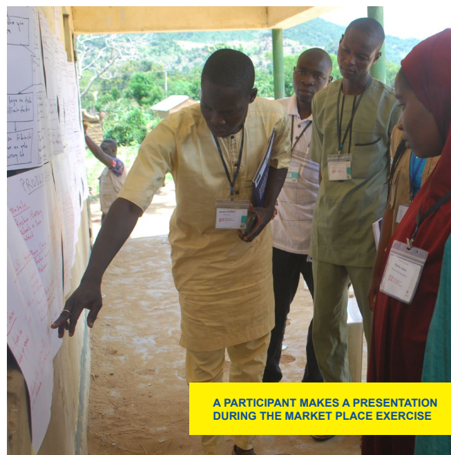
A PARTICIPANT MAKES A PRESENTATION DURING THE MARKET PLACE EXERCISE

While stakeholder sensitization, ward analysis and community mobilization played a crucial role in the CDP process, the Community Development Planning Session itself is the heart of the process. This 4-day session is akin to the village/town meetings where members of the community come together to discuss issues that affect their development and plan activities to overcome those development gaps. The major objectives of the CDP sessions are: